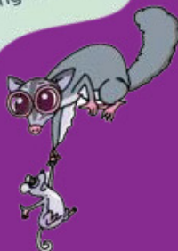
Rover the sugar glider

I show respect - I am kind and caring to others.