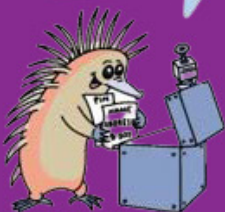
Wendie the echidna

I am responsible - I protect my personal information.