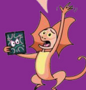
Buffy the frilled neck lizard

I trust my feelings - I ask for help when something doesn't feel right.