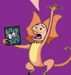
Buffy the frilled neck lizard

I trust my feelings - I ask for help when something doesn't feel right.