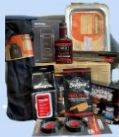
VALUED AT $175