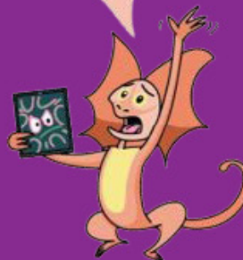
Buffy the frilled neck lizard

I trust my feelings - I ask for help when something doesn't feel right.