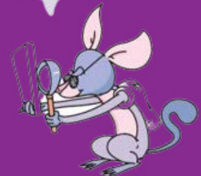
Ellie the eel

I investigate - I question what I see, hear and do online.