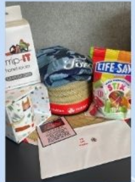
VALUED AT $80