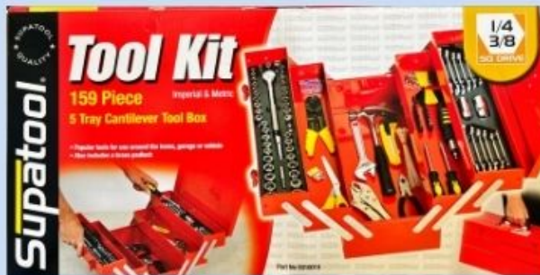
VALUED AT $250