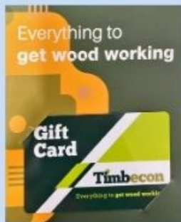
VALUED AT $100