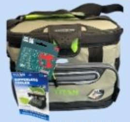
VALUED AT $55