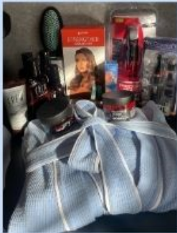
VALUED AT $150