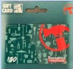
VALUED AT $50